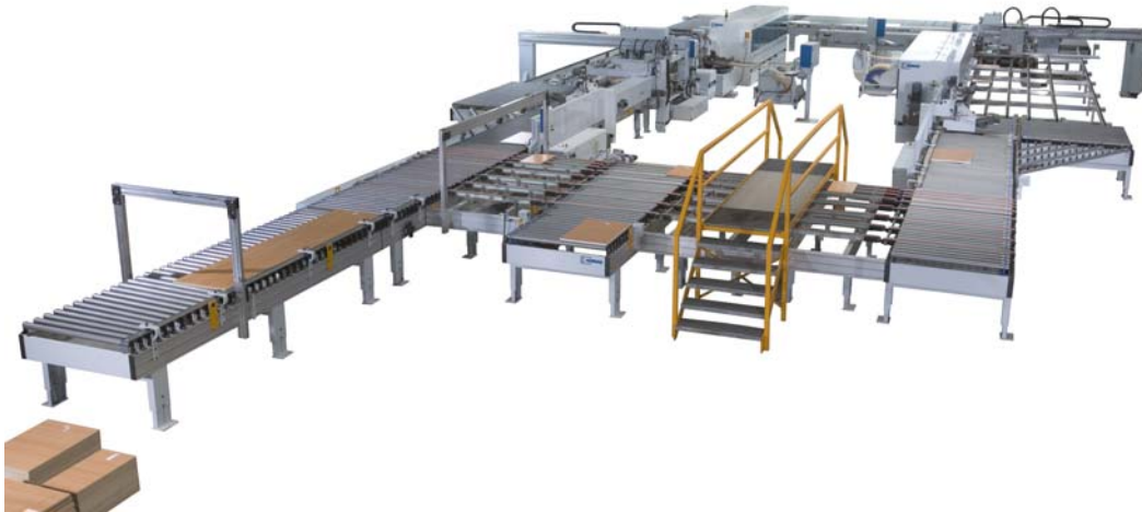
Fig. 1: Edge processing in batch size 1 Plant with automatic part recognition