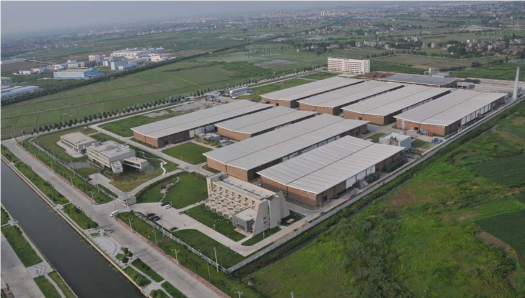
Fig. 1: CHINAFLOORS