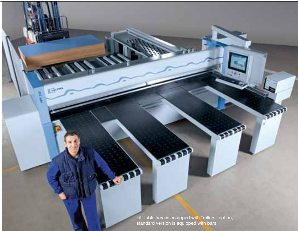
Lift table here is equipped with "rollers" option, standard version is equipped with bars