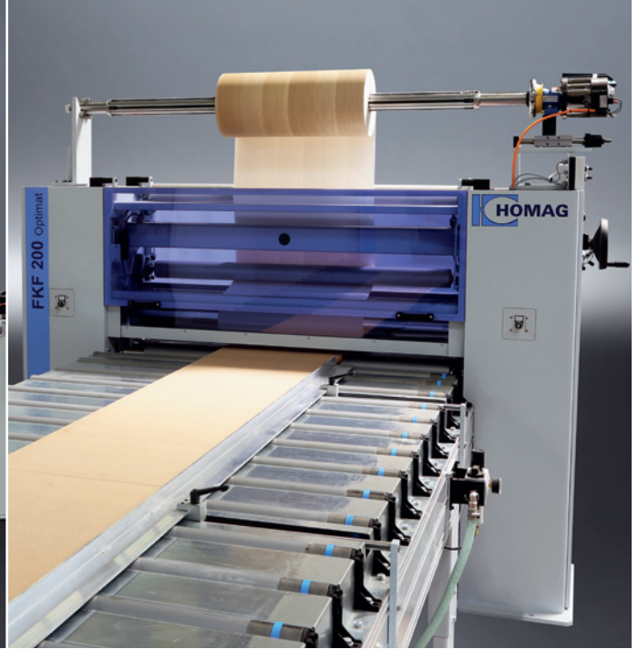
Laminating calender with unwinding station