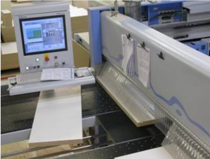
Picture 5: HPL 380 control panel with the CADmatic 4 PROFESSIONAL machine control system