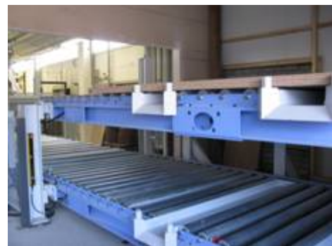
Picture 6: Additional two-level roller conveyor leading directly from the warehouse to the saw's lift table