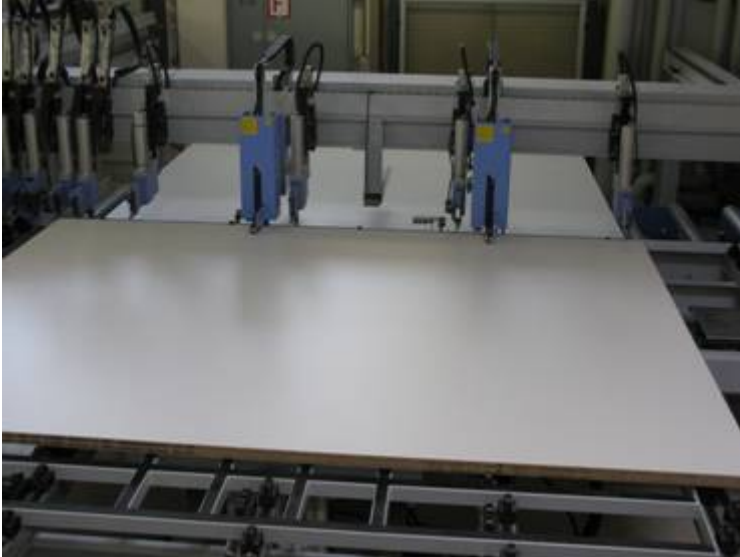
Photo 7: Automatic feeding to the saw via the lift table. In the foreground: Turning device for headcuts.