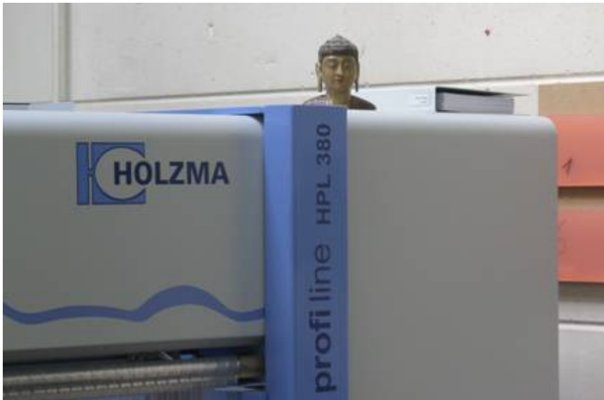
Picture 1: Quiet and peaceful: The figure of the Buddha on the HPL 380 profiLine at Hoetzel, Deggingen