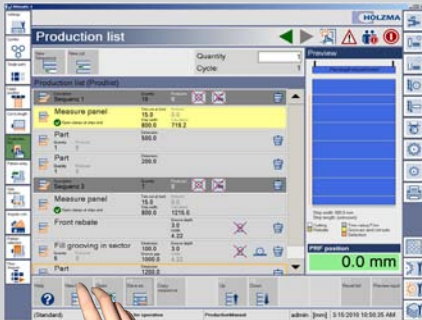
Creating a new list

Whether grooving, rabbeting or cutting to length, the “Manual Production List” module allows you to control all the functions of your panel saw using just one input screen. No need to keep changing from one control module to another and no need to create a cutting pattern first. The ideal solution for spontaneous processing ideas.