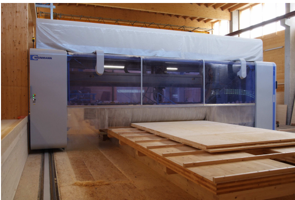
Bild 5: Plattenbearbeitungszentrum WMP 240 für die Erstellung von Massivholzelementen